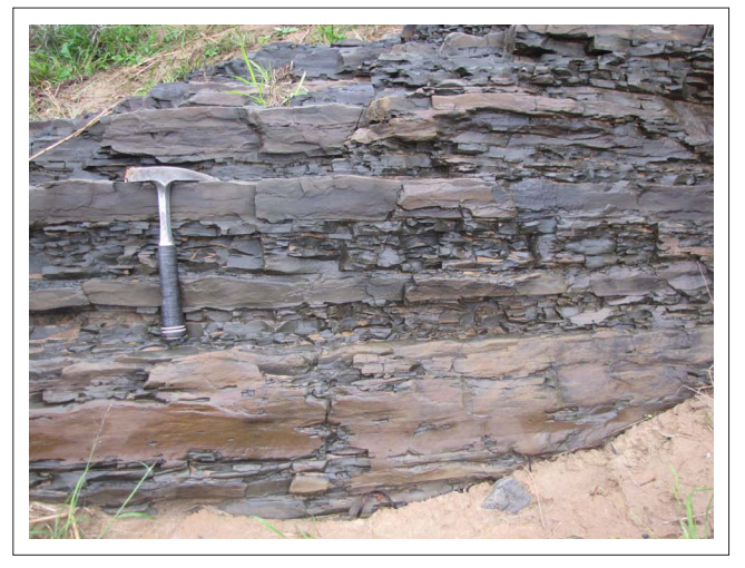
Scale: geological hammer.

Facies D comprises thick (> 0.5 m) beds of bluish-grey (5B 7/1) horizontally or ripple-laminated sandstone. The convex basal contacts are erosional and in many places contain flame structures when underlain by argillaceous beds. The sandstones are more extensive than those of Facies C and may extend more than 100 m laterally. This facies becomes more abundant towards the top of the Facies Association 2 sequence, producing an overall upward coarsening trend to the succession. Matrix supported, well-rounded intraformational mud pebble horizons with no apparent imbrication occur in places within Facies D sandstones, whilst thin mud flakes resembling 'acicular structures'<sup>25</sup> also occur at various horizons. These structures