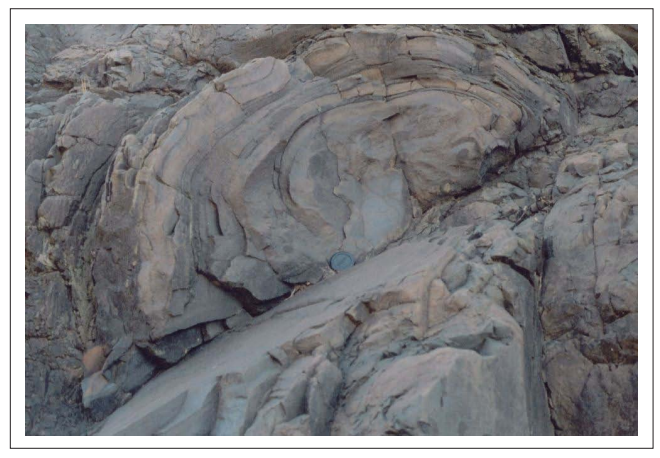
Scale: 60-mm lens cap diameter. FIGURE 4: Ball-and-pillow structure in Facies E sandstone, Signal Hill.

FIGURE 3: Rhythmic sandstone-mudstone couplets of Facies A on Coniston.