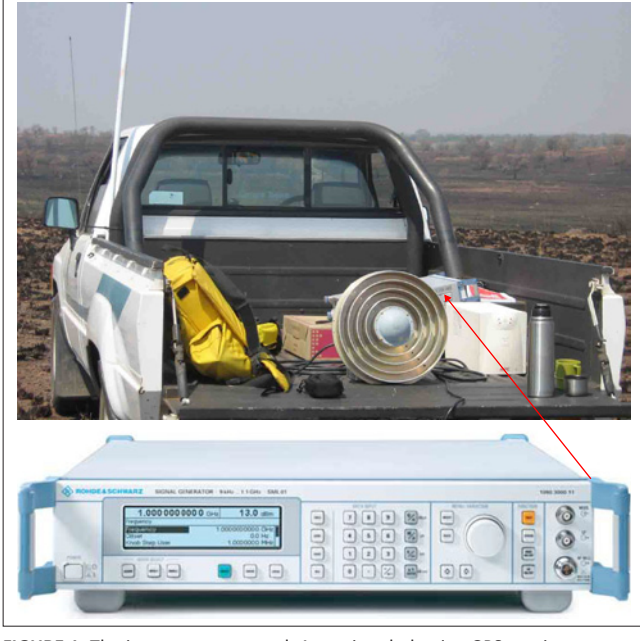
FIGURE 1: The jammer set-up used. A passive choke ring GPS receiver antenna was used as the transmitting antenna and matched the impedance of 50 \Omega of the signal generator on both L1 and L2 frequencies.

Unintentional jamming of GPS receivers by radars used in the SANDF that use the L-band was also tested, using two such