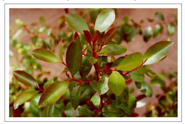
A young khat shrub

Khat belongs to the kingdom Plantae, class Magnoliopsida, order Celastrales, family Celastraceae, genus Catha and species edulis. The shrub khat (Catha edulis Forsk.) has a slender trunk with smooth, thin bark. The lancet-shaped leaves are between 0.5 cm and 10 cm long and between 0.5 cm and 5 cm wide. Young leaves are reddish green, later turning to yellow-green (Figure 1). The leaves are faintly aromatic, with an astringent, slightly sweet taste. The tap root grows to a depth of 3 m