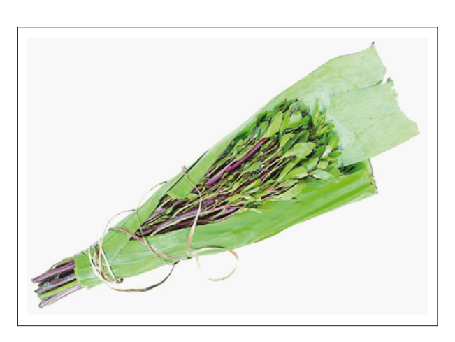
FIGURE 2 A bundle of khat wrapped up in banana leaves

During maturation, cathinone is metabolised into cathine ([+]- norpseudoerhedine in a ratio of approximately 4:1).<sup>15,16</sup> Other phenylalkylamine alkaloids in khat leaves are the phenylpentanylamines meru-cathinone, pseudomerucathine and merucathine. These, however, seem to contribute less to the stimulatory effect of khat.<sup>17,18</sup> Cathinone is unstable and undergoes decomposition reactions after the harvesting and during the drying and extraction of the plant,<sup>17,18</sup> leading to a 'dimer' (3, 6-dimethyl-2, 5-diphenylpyrazine) and possibly to small fragments. Both the dimer and phenyl-propanedione have been isolated from khat extracts.<sup>19</sup> That cathinone is presumably