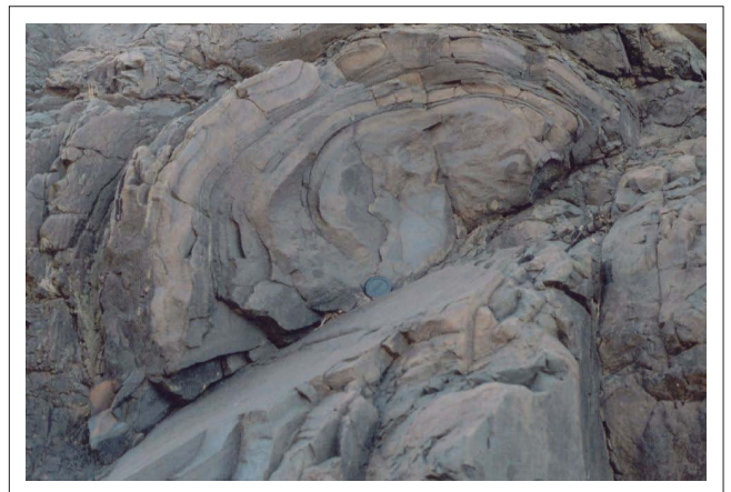
Scale: 60-mm lens cap diameter.