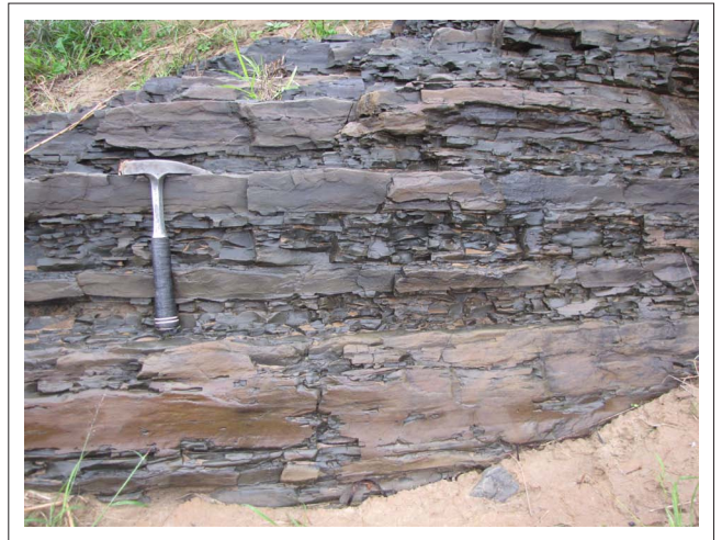
Scale: geological hammer.

Facies D comprises thick (> 0.5 m) beds of bluish-grey (5B 7/1) horizontally or ripple-laminated sandstone. The convex basal contacts are erosional and in many places contain flame structures when underlain by argillaceous beds. The sandstones are more extensive than those of Facies C and may extend more than 100 m laterally. This facies becomes more abundant towards the top of the Facies Association 2 sequence, producing an overall upward coarsening trend to the succession. Matrix supported, well-rounded intraformational mud pebble horizons with no apparent imbrication occur in places within Facies D sandstones, whilst thin mud flakes resembling 'acicular structures' 23 also occur at various horizons. These structures