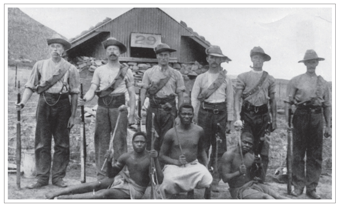
'Colonial troops and African auxiliaries at a blockhouse.' Reprinted from The War for South Africa, courtesy of the National Army Museum, London.

if the questions are too hard to answer, the temptation is for politicians to forget about the past completely or to get it spectacularly wrong in the name of inclusive nation building.